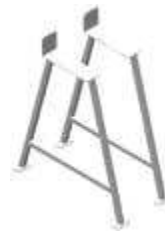
Pair of supports for ACS assemblies