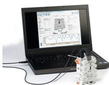
Configuration via WAGO Interface Configuration Software