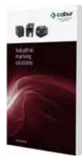
INDUSTRIAL MARKING SOLUTIONS