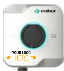
CUSTOM LOGO COVER

By coupling an external meter to an EVO Series station, it is possible to activate the Dynamic Power Management function avoiding disconnection of household domestic main appliances. The same energy meter is needed to activate the functions for photovoltaic integration.