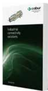
INDUSTRIAL CONNECTIVITY SOLUTIONS