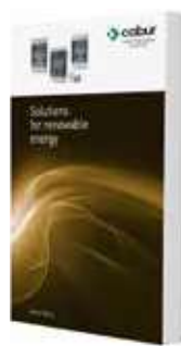
SOLUTIONS FOR ENERGY TRANSITION