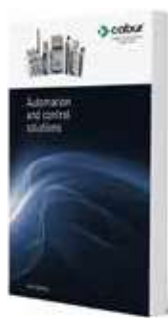
AUTOMATION AND CONTROL SOLUTIONS