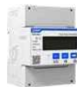
THREE-PHASE DIGITAL ENERGY METER