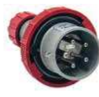
Straight mobile plugs quick-mounting with phase inverter 50-60Hz IP67

Features: all products are packed separately.