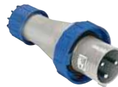
Straight mobile plugs quick-mounting 50-60Hz IP67

Features: all products are packed separately.