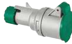
Straight mobile socket-outlets quick-mounting for special applications IP44

Features: all products are packed separately.