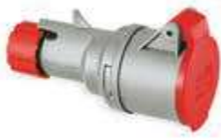
Straight mobile socket-outlets quick-mounting 50-60Hz IP44