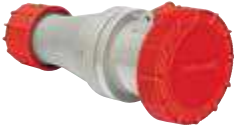
Straight mobile socket-outlets quick-mounting 50-60Hz IP67

Features: all products are packed separately.