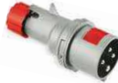
Straight mobile plugs quick-mounting 50-60Hz IP44