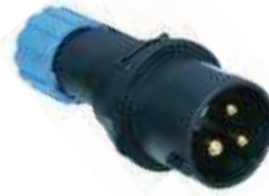
Straight mobile plugs quick-mounting black colour 50-60Hz IP44

Features: all products are packed separately.