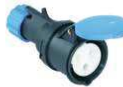
Straight mobile socket-outlets quick-mounting black colour 50-60Hz IP44

Features: all products are packed separately.