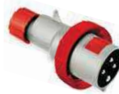
Straight mobile plugs quick-mounting 50-60Hz IP67

Features: all products are packed separately.