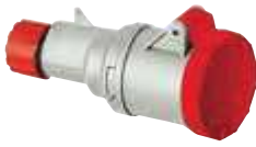
Straight mobile socket-outlets quick-mounting 50-60Hz IP67