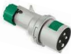
Straight mobile plugs quick-mounting for special applications IP44