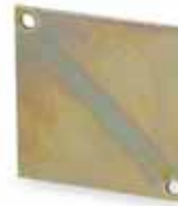
Back plates in galvanized steel for TAIS boxes