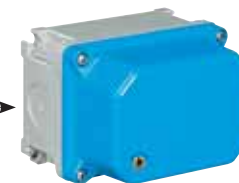
Junction boxes in thermosetting (GRP) with high cover IP67