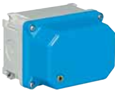
Junction boxes in thermosetting (GRP) with high cover IP68

Characteristics: IP68 protection rating test is carried out at 4 Mtrs depth for 24 h. Blind walls.