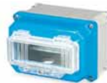
Junction boxes in thermosetting (GRP) with transparent window IP67

Uses: for fixing terminal or modular devices.