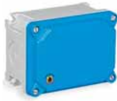
Junction boxes in thermosetting (GRP) with low cover IP68