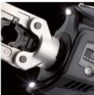
LED lighting of the working area