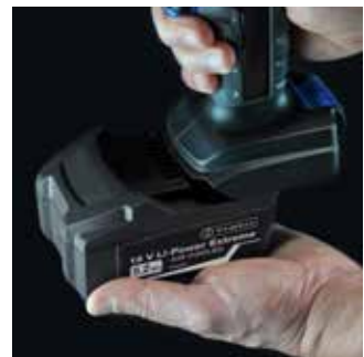
Slot-in battery with release button