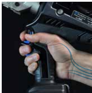
Anatomically shaped grip for improved comfort