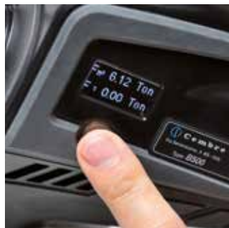
Multifunction OLED display with touch button