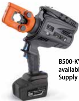
B500-KV version also available for Power Supply Companies