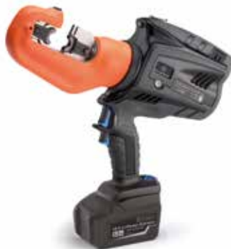
B550-KV version also available for Power Supply Companies