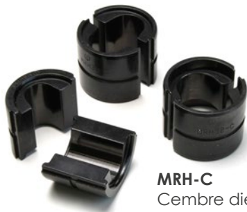
MRH-C Cembre die sets