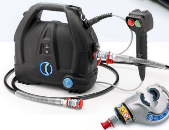
B70M-P36 36V Portable electro-hydraulic pump + RHC131 130 kN hydraulic preshead