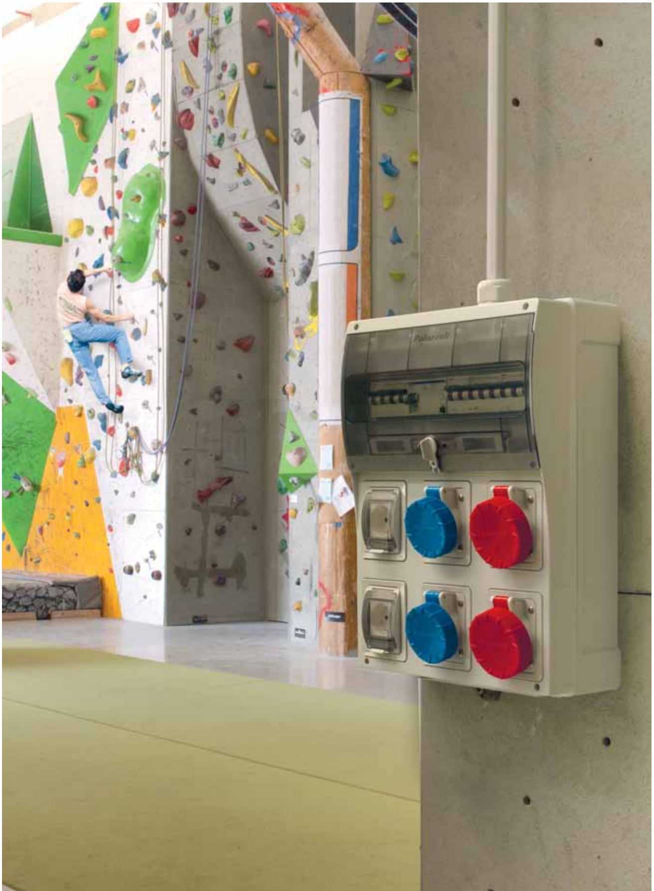
Suitable for hypermarkets, hotels, schools, offices, hospitals, kitchens, trade fairs and production areas.